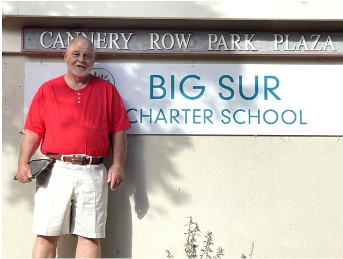
Your new Big SIR (next year). Maybe he is going to school for Big SURS!!!