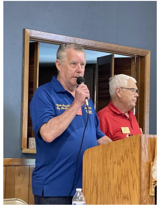
Big SIR Reporting