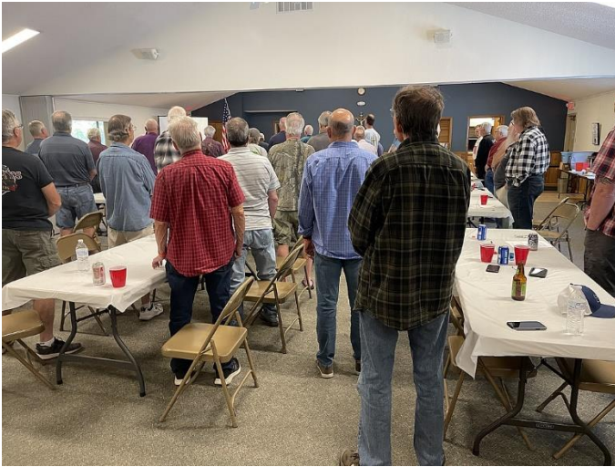
SIRs Standing for Lunch Opening Ceremony