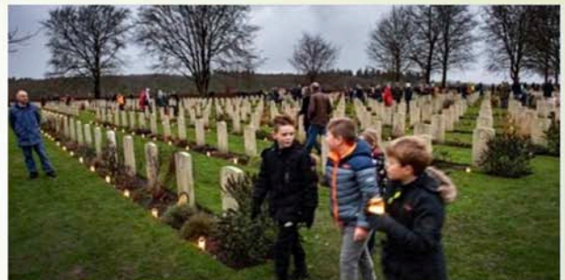
Children taking care of graves

For the past 70 years, Dutch families have come to the cemetery every Sunday to care for a grave they adopted. Hundreds of people are currently on a waiting list to become caretakers.