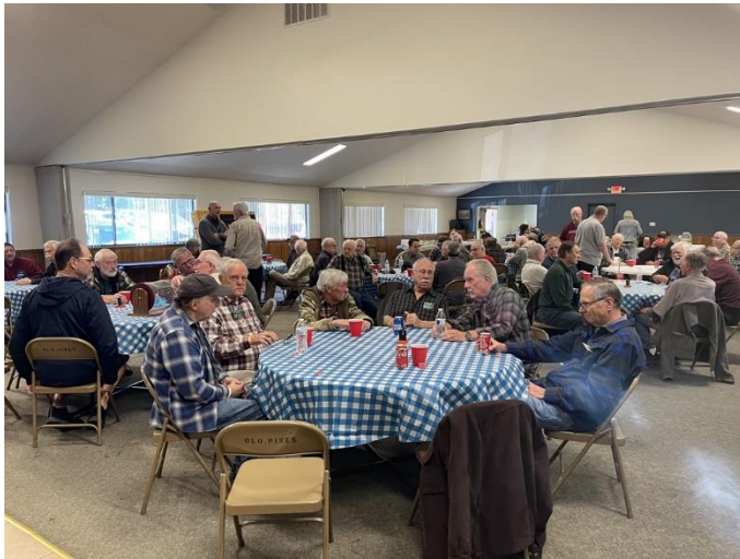
SIRs at New Round Tables with New Tablecloths