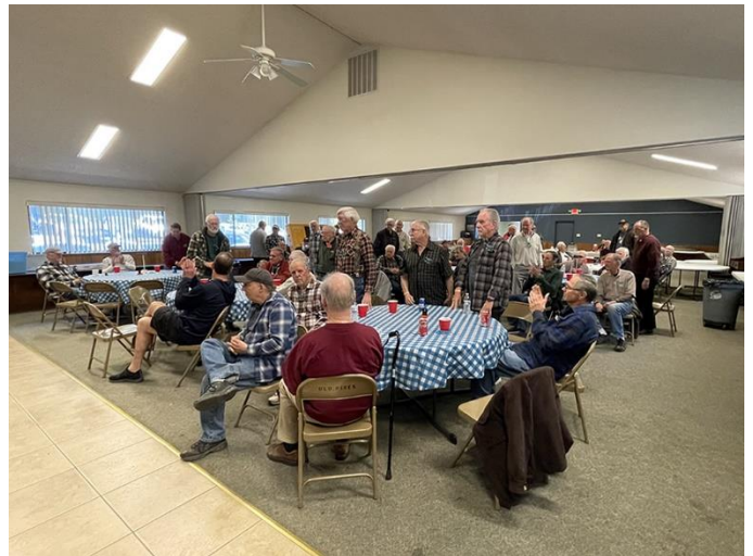
SIR15 Veterans Standing for Veterans Day