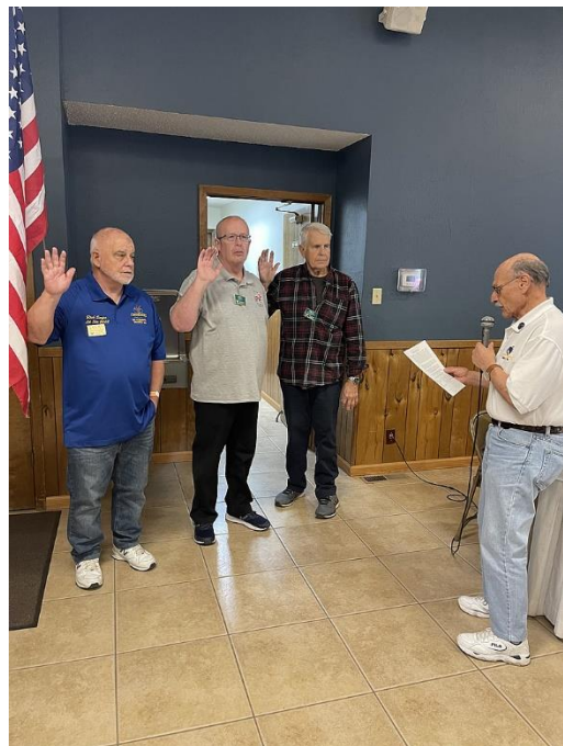
Area Governor Swears in SIR15 Officers for 2023