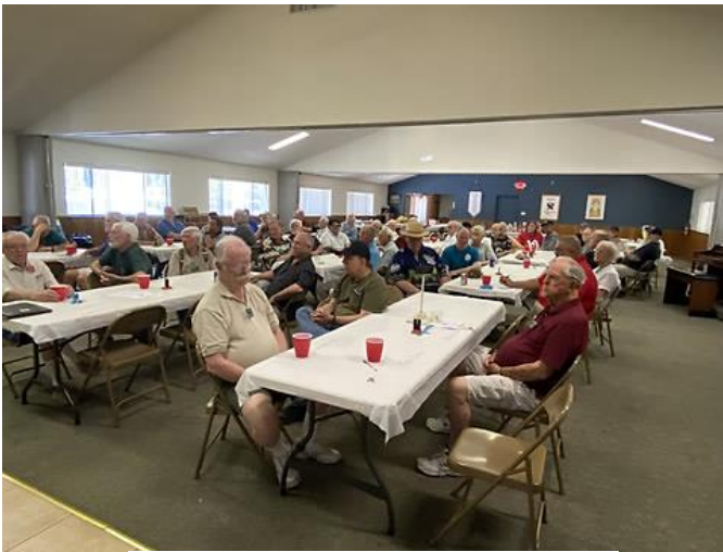
SIRS Listening to Guest Speaker