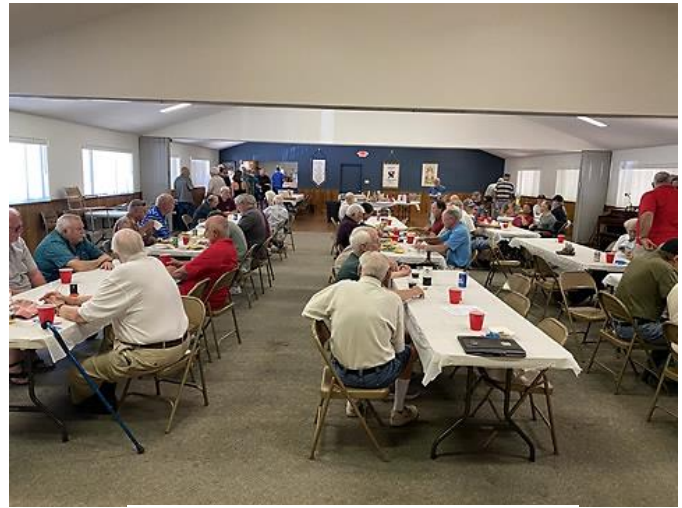
SIRS Getting Lunch