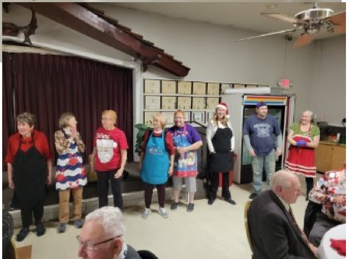
OUR MOOSE STAFF