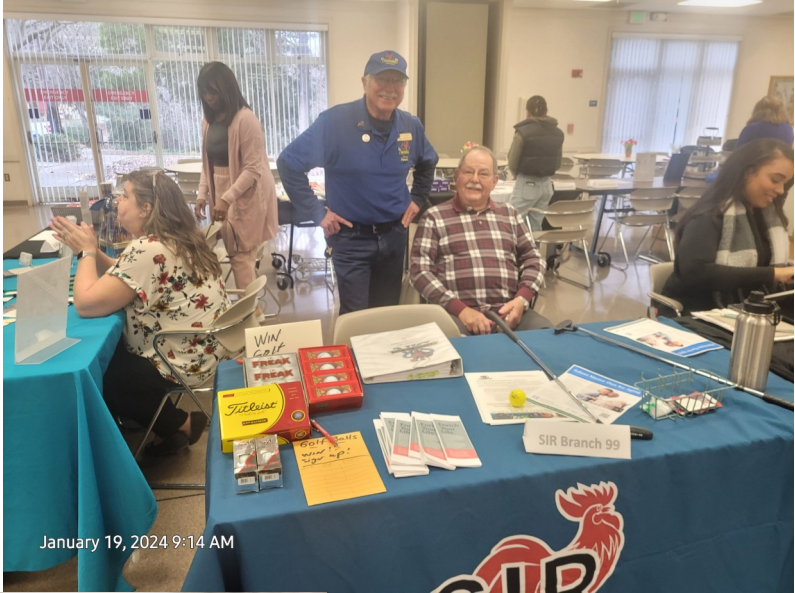
January 19, 2024 9:14 AM