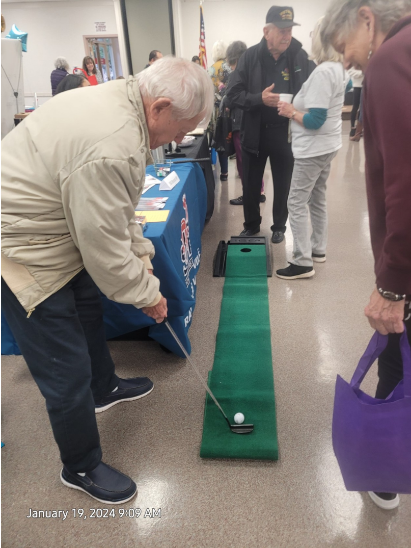
January 19, 2024 9:09 AM