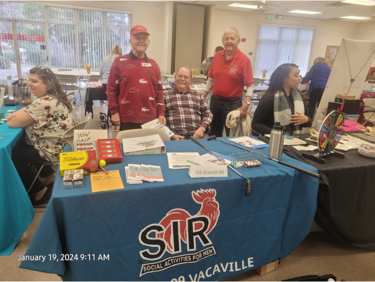
January 19, 2024 9:11 AM