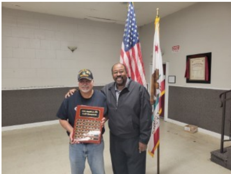
SIR ART CALDERON