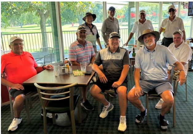
Some of the golfers rehydrating and catching up with one another in the clubhouse following their recent round at Bing Maloney.

For those new to our SIR 95 Branch, if you would like to join us for our golf rounds, please let me know. Our schedules, rules, application, etc. are also on the golf page . If you are currently a member of NCGA, they still require us to have you pay again. If you do not belong to NCGA, the golf dues also covers your NCGA dues for the rest of the year.