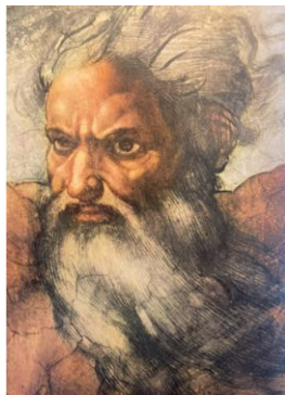
"God the Creator" by Michelangelo on Sistine Chapel Ceiling

I also I found a coffee table book which I acquired a few years ago left by the previous owner of the house I now occupy. It is called The World's Great Religions. It was published by Henry Luce, Editor-in-Chief of Time Inc. in 1957! It could be collectable. It reviews how mankind worships and makes the point that endless are the forms man's religion have taken. It covers not ancient religions but the practice of the worlds most prevalent still practiced religions from Hinduism, Buddhism, Philosophy of China, World of Islam, Law of Judaism and the Faith of Christianity. Here is an image from the inside cover of the book: