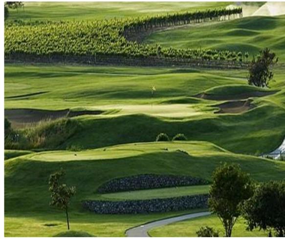
* Eagle Vines Golf Course, Napa *