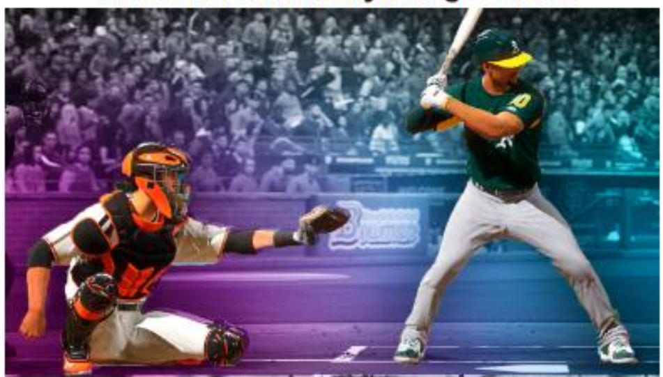
SIR Day at the Ballpark June 7, 2020, Sunday, 1pm Oakland Coliseum, Section 106 (shaded) Cost: $55/ticket