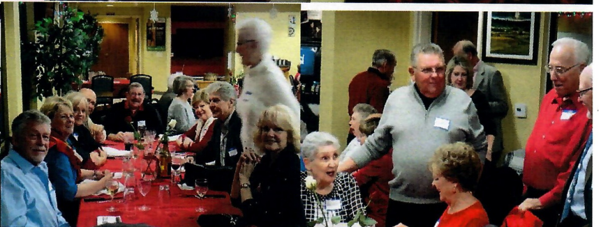
Gold Country Branch 95 - Bulletin 354 - January 2019