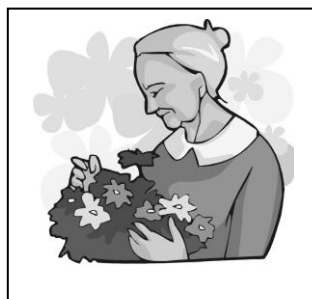
MOTHER'S DAY May 12th