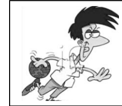
"I hope I get a spill strike."