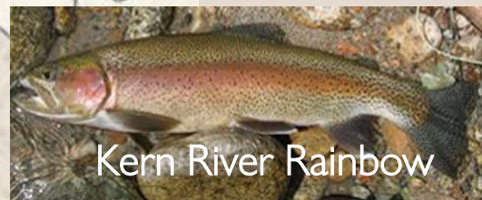
Kern River Rainbow