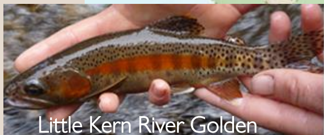
Little Kern River Golden