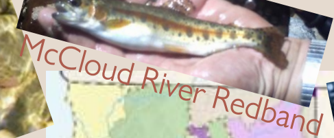
McCloud River Redband