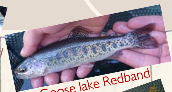
Goose Lake Redband