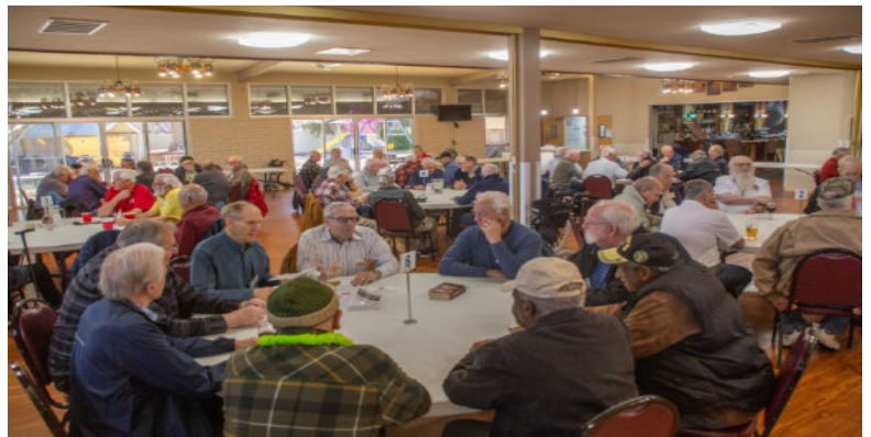
Another great turnout for this month's luncheon