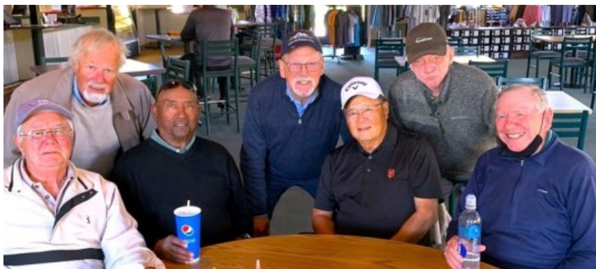
Some of the guys enjoying camaraderie after our golf game