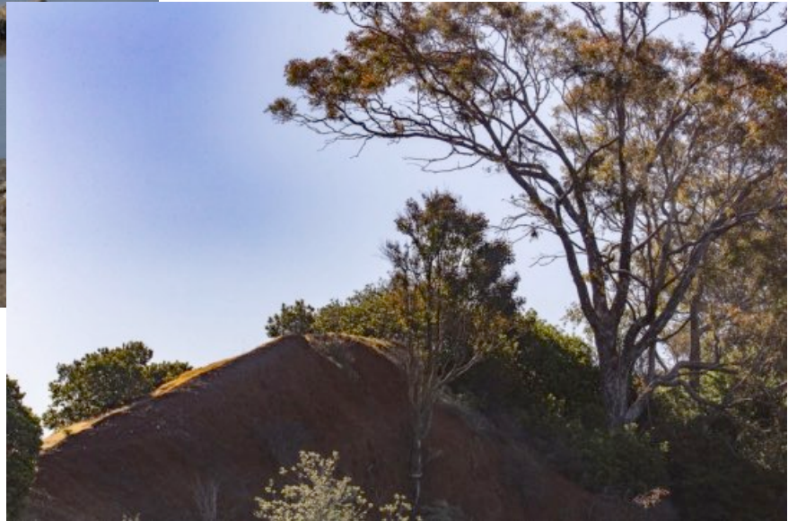
Wednesday Walker