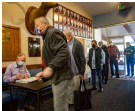
A great turnout for our last luncheon considering the fact that many members are still reluctant to venture out.