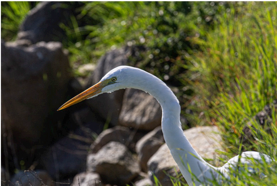
A photo collage from Tule Lake taken by Bruce Roberts Feb 8, 2020