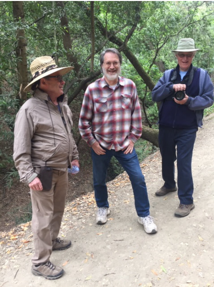
Wednesday Walkers Continue their ventures.