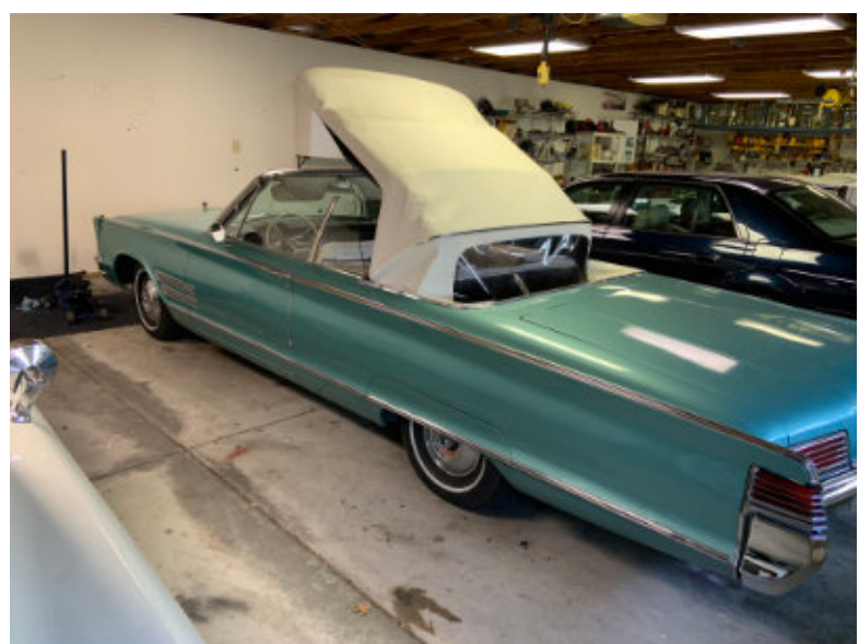
The view in Larry's Garage October, 2020