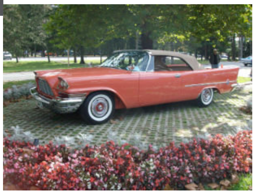
300 C Cote