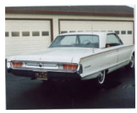
300L Rear Deck