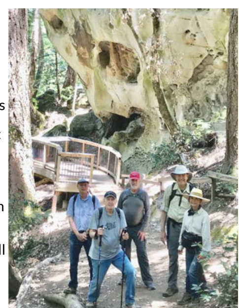
Group 2 at Tafoni Sandstone Formation

Our hikes are designed to encourage spouse participation. Initially, we will visit large nature preserves in the local area that will not require carpooling. There will opportunities to socialize and get to make new friends. Pack a lunch and we will stop at a scenic spot to eat, and enjoy nature. Any Branch 35 member, spouse, or friend who is fully inoculated and able to enjoy a moderate hike of up to 5 miles and less than 900 feet elevation gain is invited to join us.