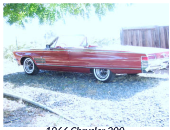
1966 Chrysler 300