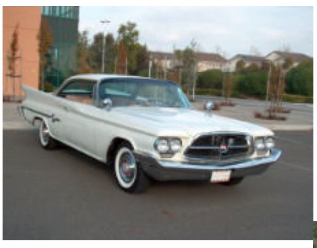
300F for 2008 Calendar

to explain that even if the paint and seats were pretty nice, they all would have to be replaced anyhow and the more dramatic the change, the easier it is to write the checks. It won multiple awards including the Franklin-Templeton award at the Hillsboro Concours for most elegant post-war open car and made the cover of the expensive Collectible Automobile Magazine. She changed her tune when we received a check for $100,000 when it sold some years ago. Other complete restorations include a 1933 Chrysler, 1966 427 Hemi Charger, 1951 Cadillac convertible, 1962 Imperial convertible, 1948 Chrysler street rod, 1966 300 convertible, 1961 ram-inducted Dodge, and a dozen others that were just fun to own but not rebuild or refresh.