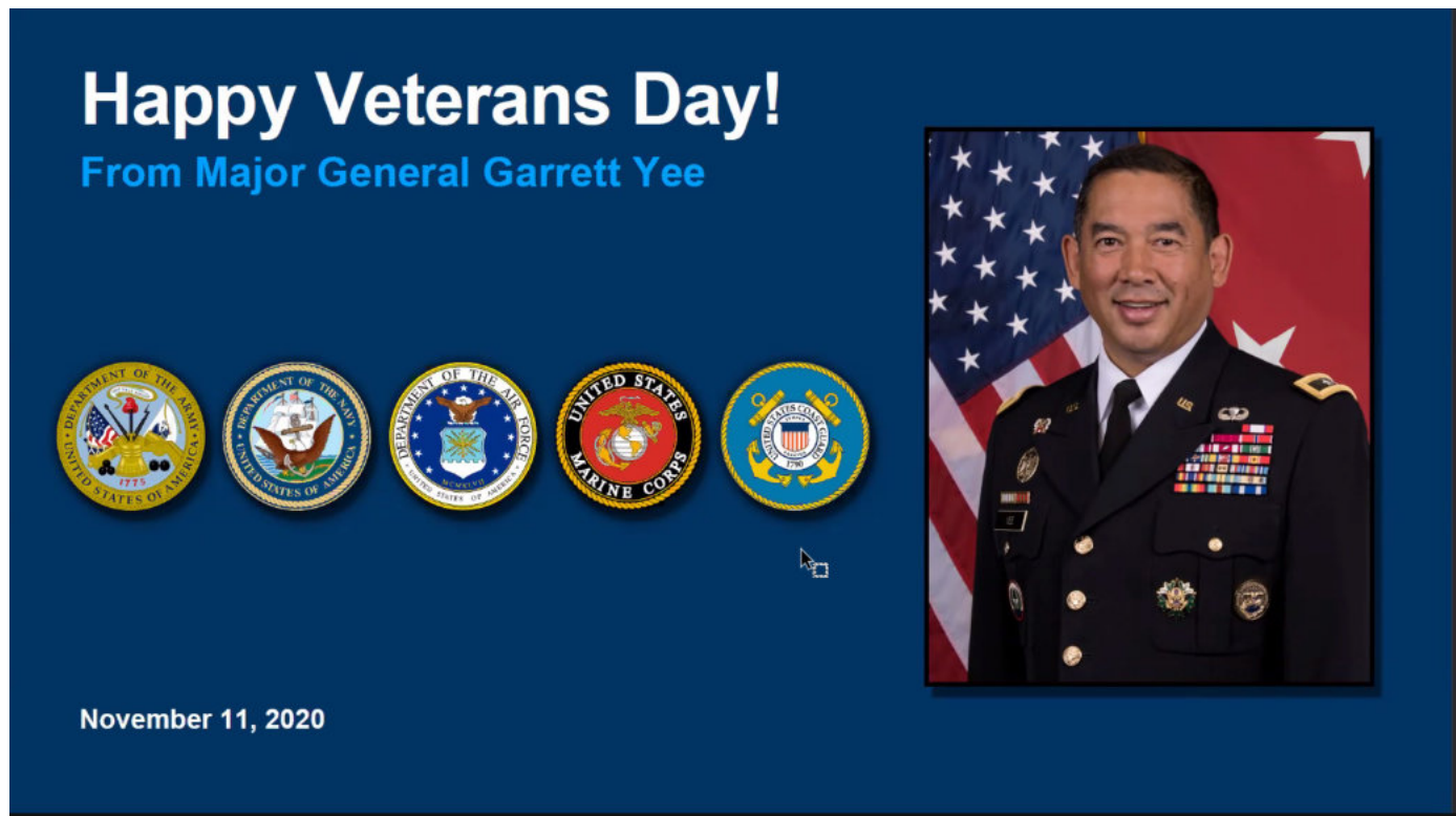
Our guest speaker from November--A Fremont native.