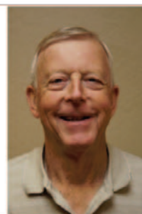
John Pesek Age 80