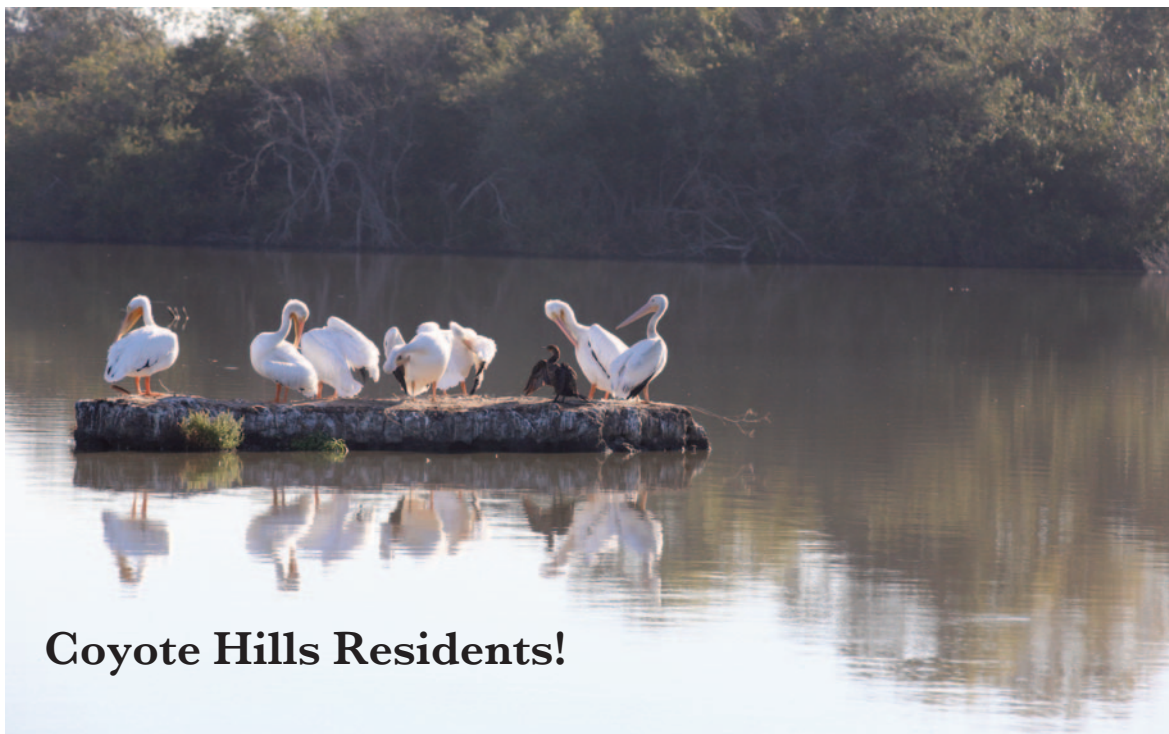
Coyote Hills Residents!