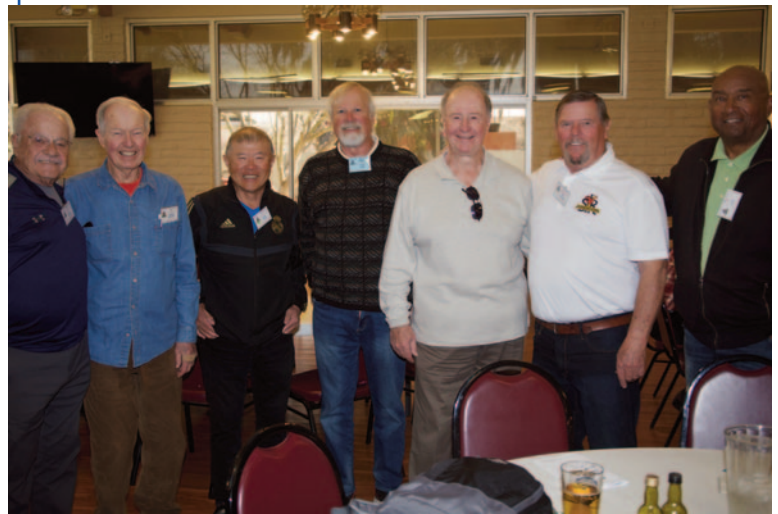
A very congenial group of Branch 59 golfers!