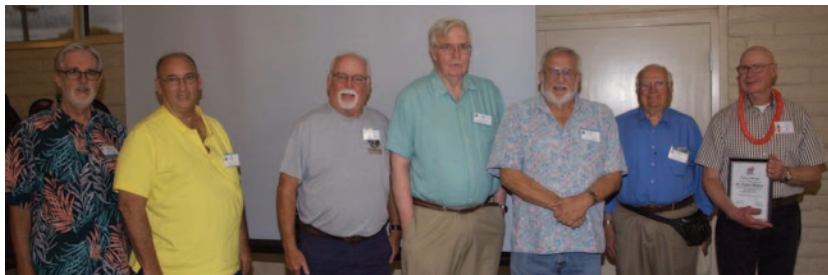
We were fortunate to have a large group of six guests last month, along with one new member.