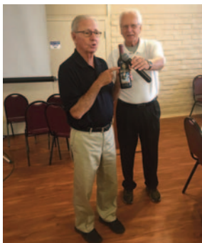
Good for the heart—in moderation!