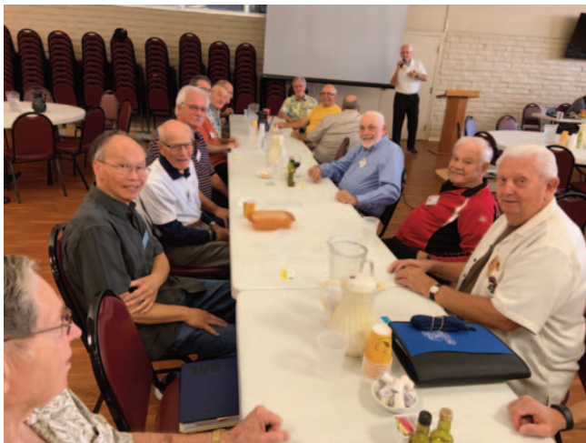
The September birthday "boys"