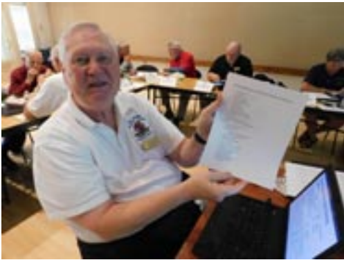
State SIR Board Meeting May 31, 2019