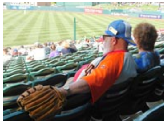
Sacramento Area SIR Branches Raley Field-River Cats