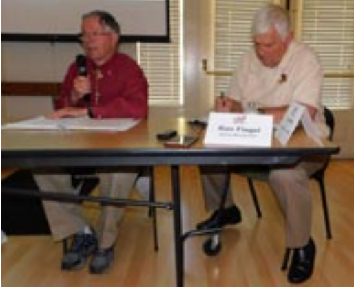
State SIR Board Meeting May 31, 2019