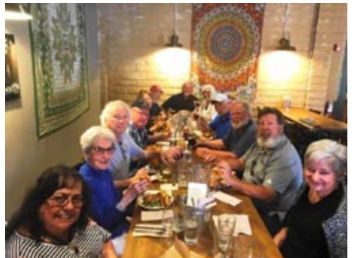
SIR Beer Tasting at 1849 Brewery