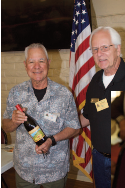
Some happy wine drawing recipients.