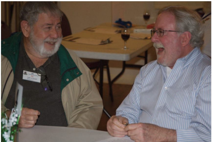
SIR meetings are fun! A great place to meet with friends.