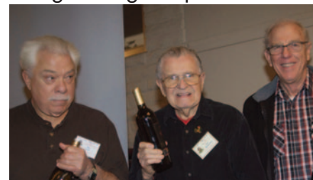
Stick around to win the wine