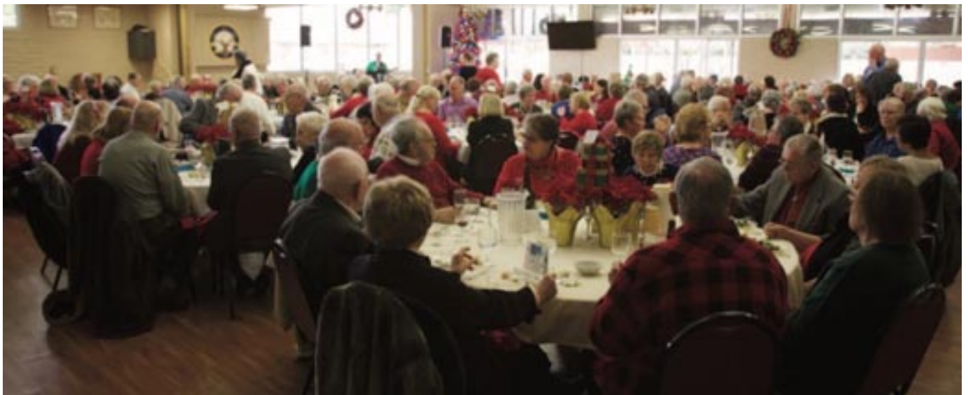
Branch 59, Fremont Holiday Luncheon