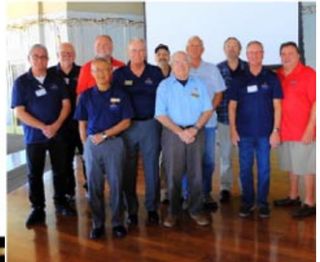
Branch 170 Holiday Dinner and new Officers.