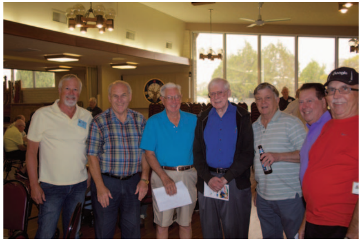
Looks like a group of golfers to me.....