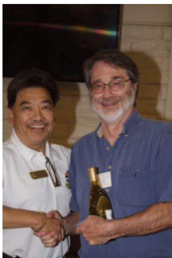
From Sir Victor goes the spoils!