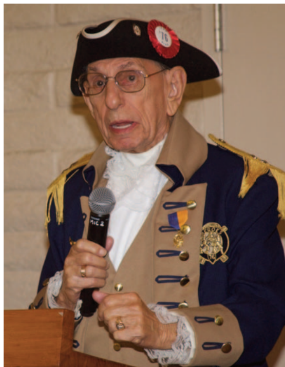
The Building of the flag presentation by the National Sojourners, Inc. was enjoyed by all at the July luncheon.