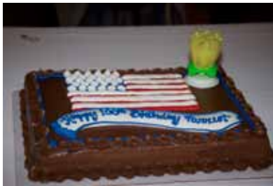
Memories of Forrest's 100th Birthday