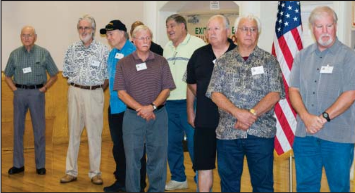
New members gather for recognition during the August luncheon meeting.