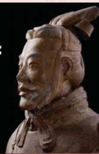
exhibit at the Asian Art Museum San Francisco

China's Terracotta Warriors: The First Emperor's Legacy