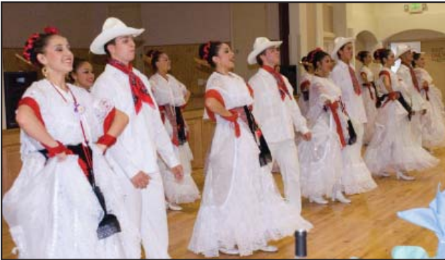
EL Ballet Folklórico de James Logan High School.