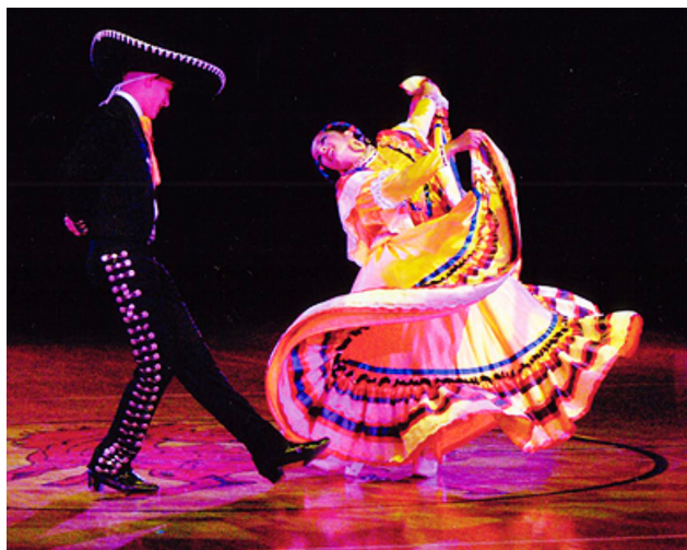
EL Ballet Folklórico de James Logan High School.

Save the Date – May 17th “Summertime Fiesta” Take your wife or a friend to lunch