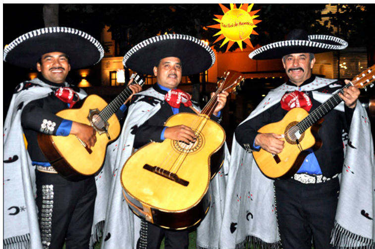
Trio Sol de America Mariachi Band.