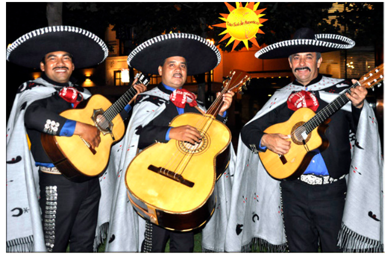
Trio Sol de America Mariachi Band.