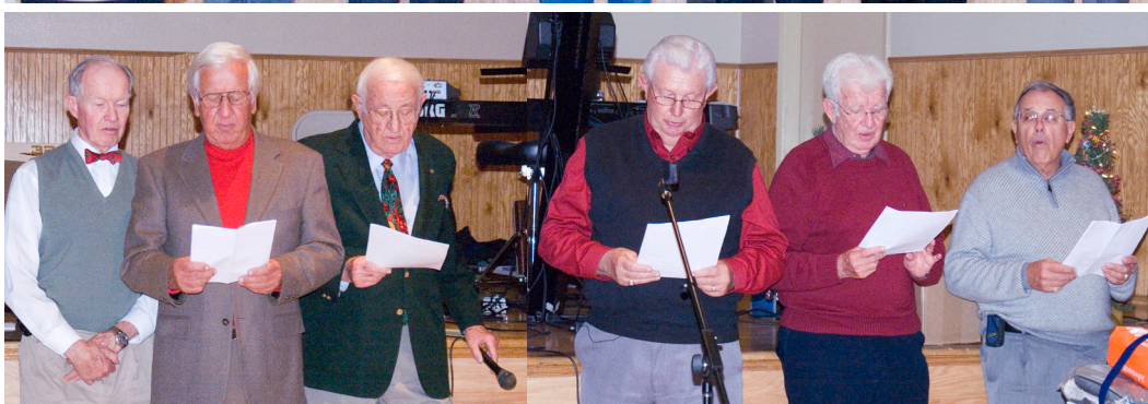
In the photo at left, the Singing Sirs entertained the members and guests at the Christmas Fantasy.