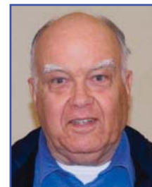
Sir Nat Lord