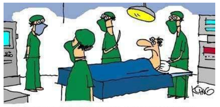
"Nurse, get on the internet, go to SURGERY.COM, scroll down and click on the 'Are you totally lost?' icon."