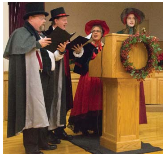
"What the Dickens" Christmas caroling group entertain during the luncheon.

Dale Hardware McIvors Hardware Spin-A-Yarn Steak House Country Way Strizzi's Lexus Cloverleaf Bowl Orchard Supply Hardware Sweet Tomatoes Simply Thai Olive Garden Goodyear Tires Safeway Trader Joe's Car Wash Establishments