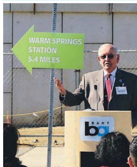
Sir Tom Blalock, BART Director, speaks at a celebration of the completion of the Walnut Avenue BART bridge in Fremont.

Members 111 Guests 1 Visitors 1 Total = 113 41 excused 20 unexcused