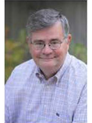
From State SIR

Please always remember to thank those responsible for arranging activities. Our many branch and State activity chairs and committees voluntarily spend hours of their time planning, arranging and managing our activities so we can come and have fun. Let these leaders know how much you appreciate them and their efforts.