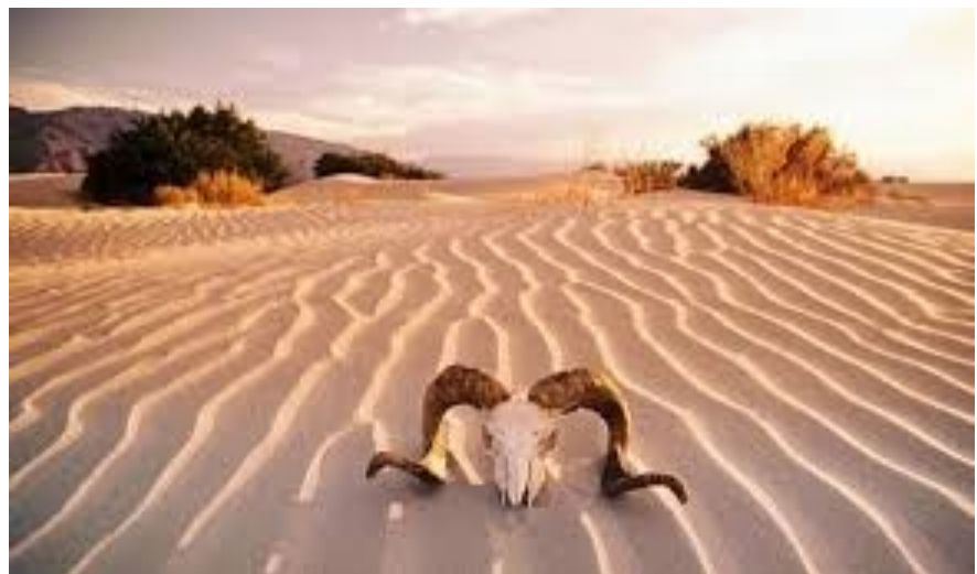
Is this our future?