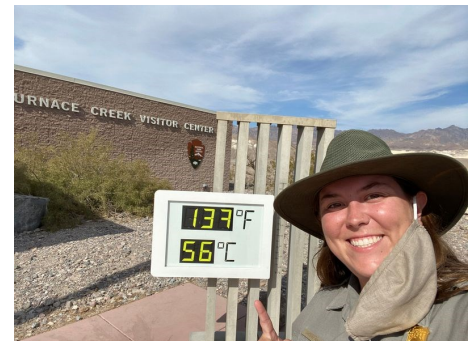
Why in the world is she smiling?