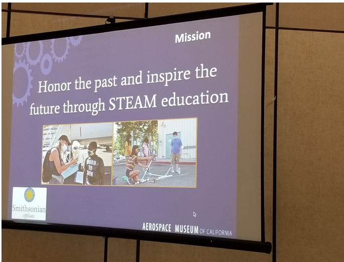
Very informative presentation on The Sacramento Aerospace Museum at McClellan Park. This organization supports education in science, technology, engineering, the arts, and math.