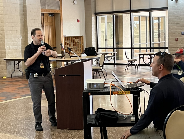
Our speakers made an interesting presentation on the Red Light Camera program in Sacramento county