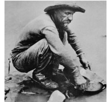
A real 49er!