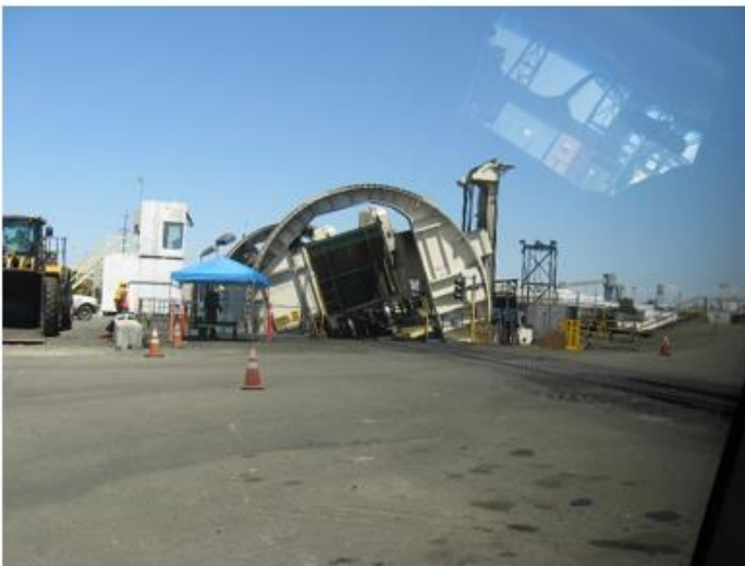
RAIL CAR DUMPER

Receives cement from Thailand and other overseas ports that is stored on the ship and processed and bagged for delivery to customers.