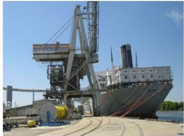
CEMENT WAREHOUSE SHIP

Receives cement from Thailand and other overseas ports that is stored on the ship and processed and bagged for delivery to customers.