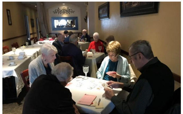
Post Luncheon Singles Winners